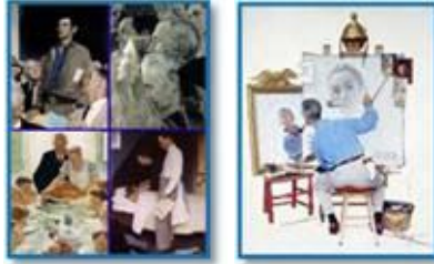
FOUR FREEDOMS POSTERS

Milwaukee: Clarion Hotel & Conference Center, 5311 S. Howell Ave